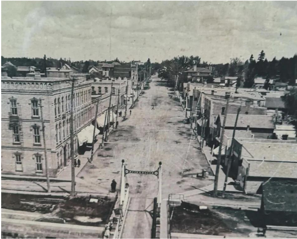
Downtown Fenelon Falls, c. 1905