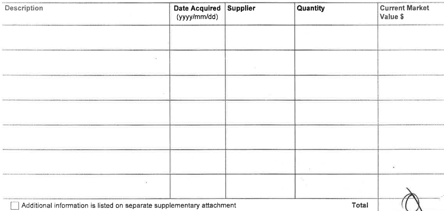
Table 4: Inventory of campaign goods and materials from previous municipal campaign used in this campaign (Note: value must be recorded as a contribution from the candidate and as an expense)