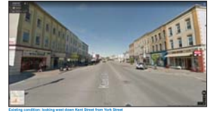
Existing condition - looking west down Kent Street from York Street