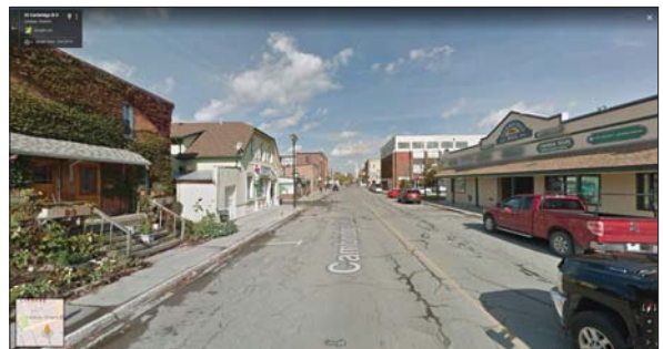
Existing condition: looking north up Cambridge Street South at the Cambridge Mall