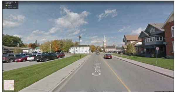
Existing condition: looking north up Cambridge Street North from the Fire Rescue Headquarters

Bump out improves pedestrian safety, protects parked vehicles and helps direct through traffic; dotted line shows potential bump out reduction that allows a dedicated right turn traffic slip-around lane to improve traffic flow, but increases crosswalk width