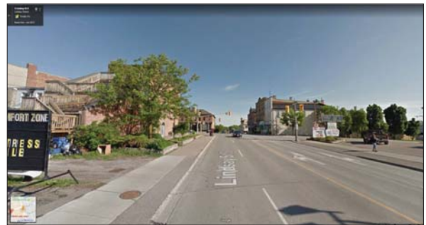
Existing condition: looking north up Lindsay Street South from south of Kent Street West