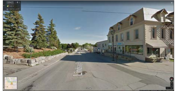
Existing condition: looking north up Lindsay Street North from Kent Street East

Depressed curb and textured/coloured "wings" to accommodate pedestrian traffic over the vehicular turn around