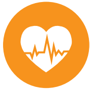
An Exceptional Quality of Life