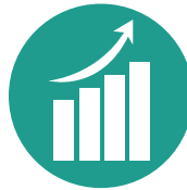
A Vibrant and Growing Economy