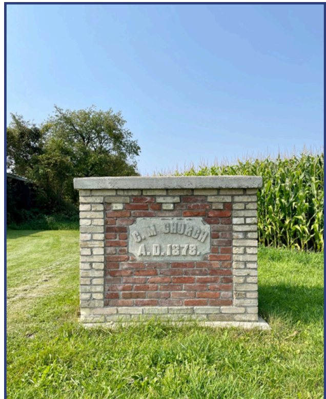
Graham Methodist Church Memorial, c. 2024