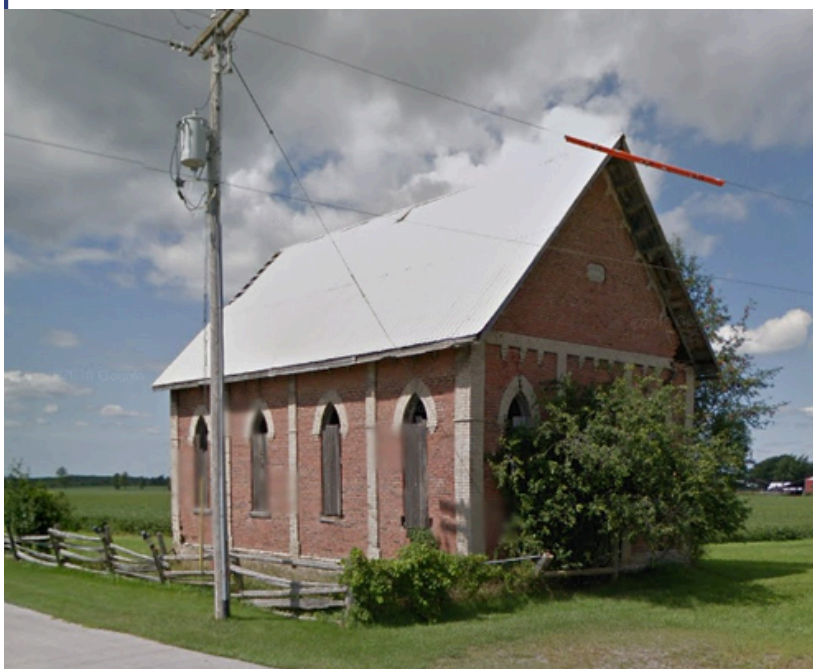
Graham Methodist Church, c. 2011

Shortly after demolition, the Graham family, that are still residents on Elm Tree Road, erected a monument using bricks from the church, featuring the date plate at its center. This monument honors the early settling families who considered Graham Methodist Church an integral part of their lives and a way to remember the building.