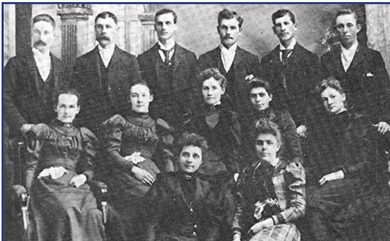
Graham's Church Choir, 1892