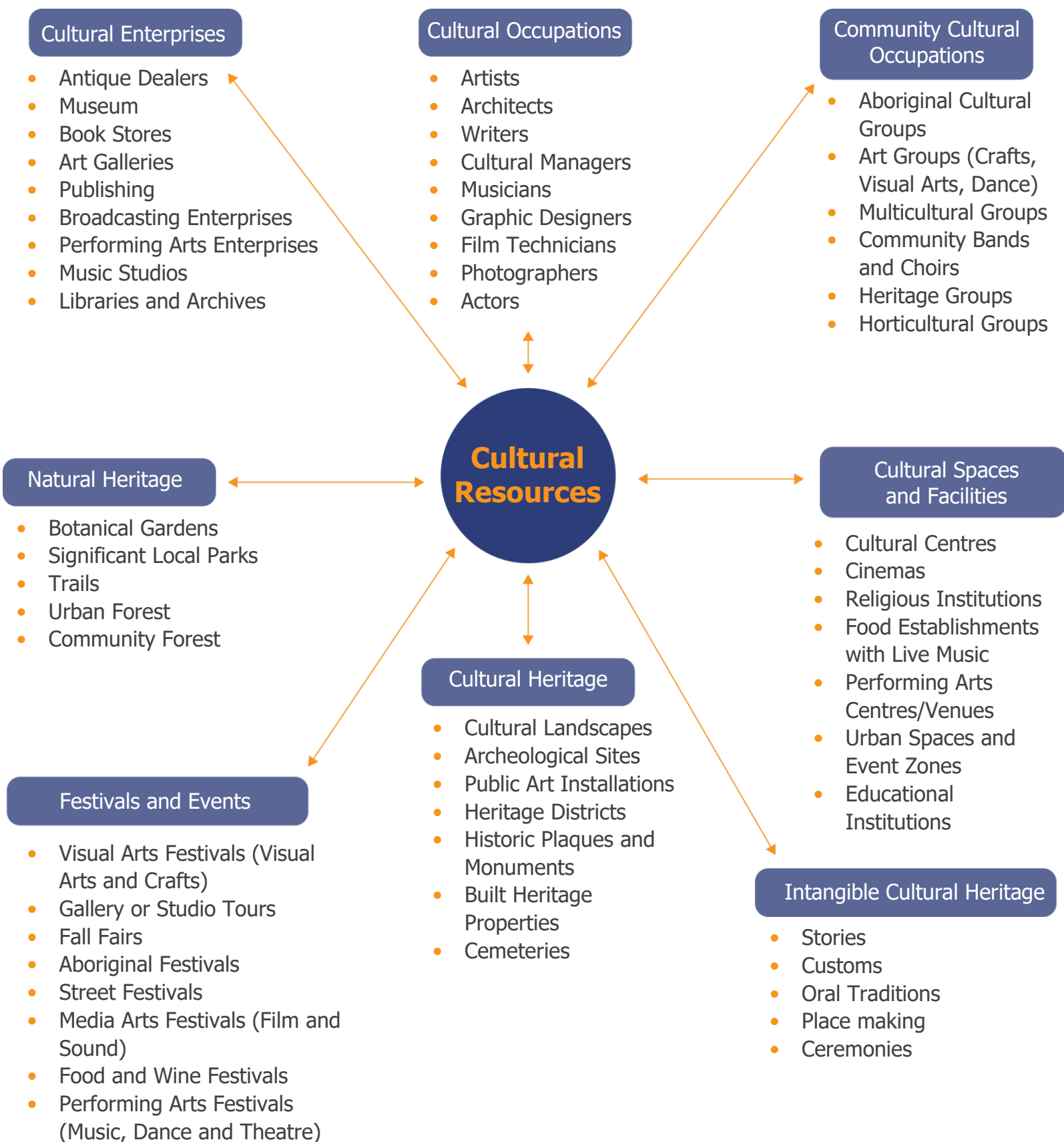
Figure Two: Cultural resource categories