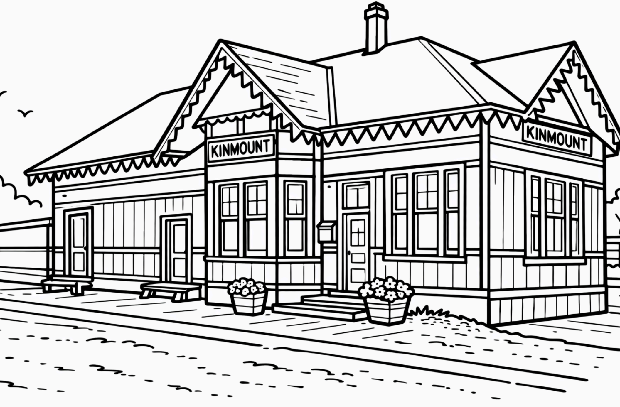
Kinmount Train Station, built 1876