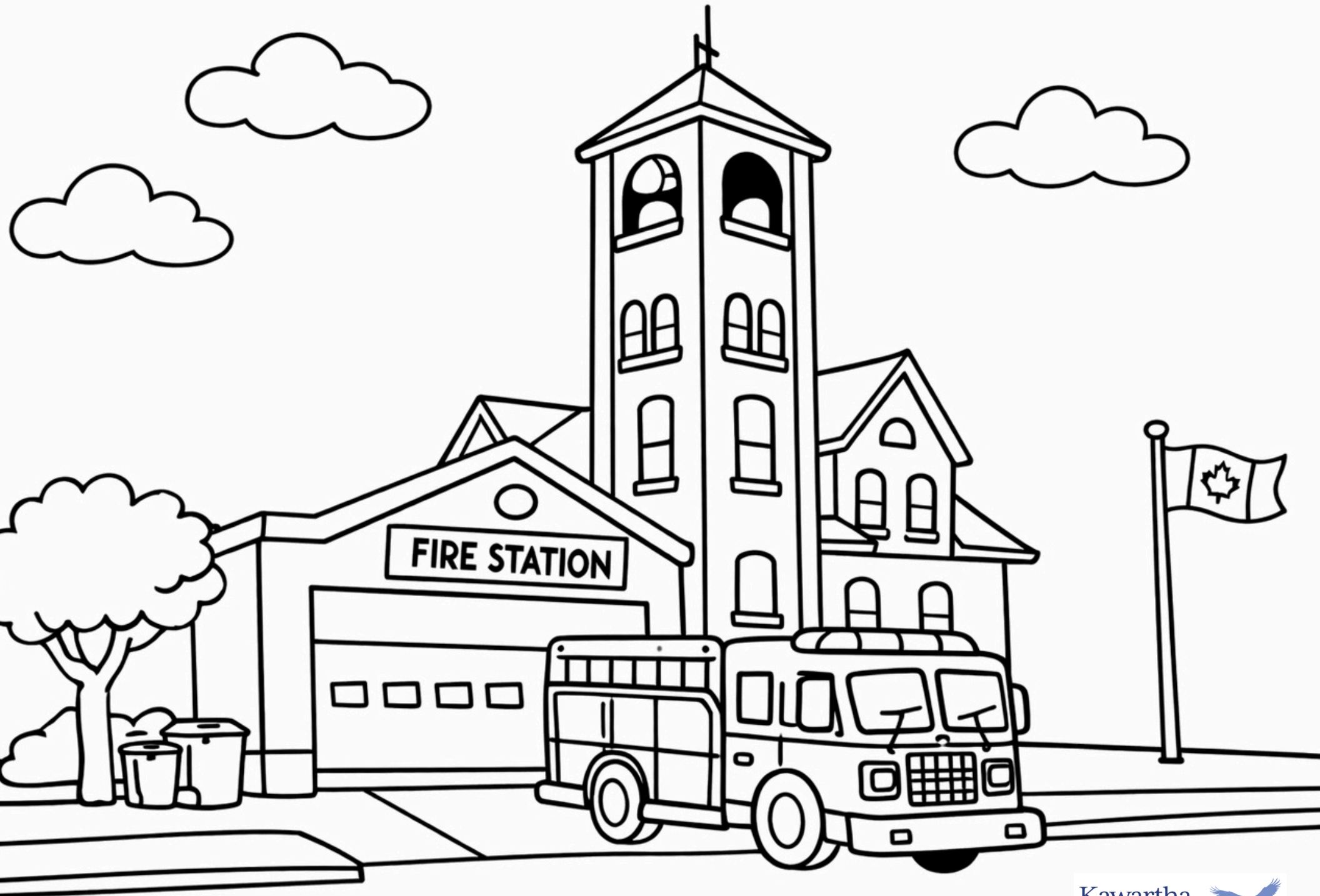
Kawartha Lakes Lindsay Fire Station, built 1909