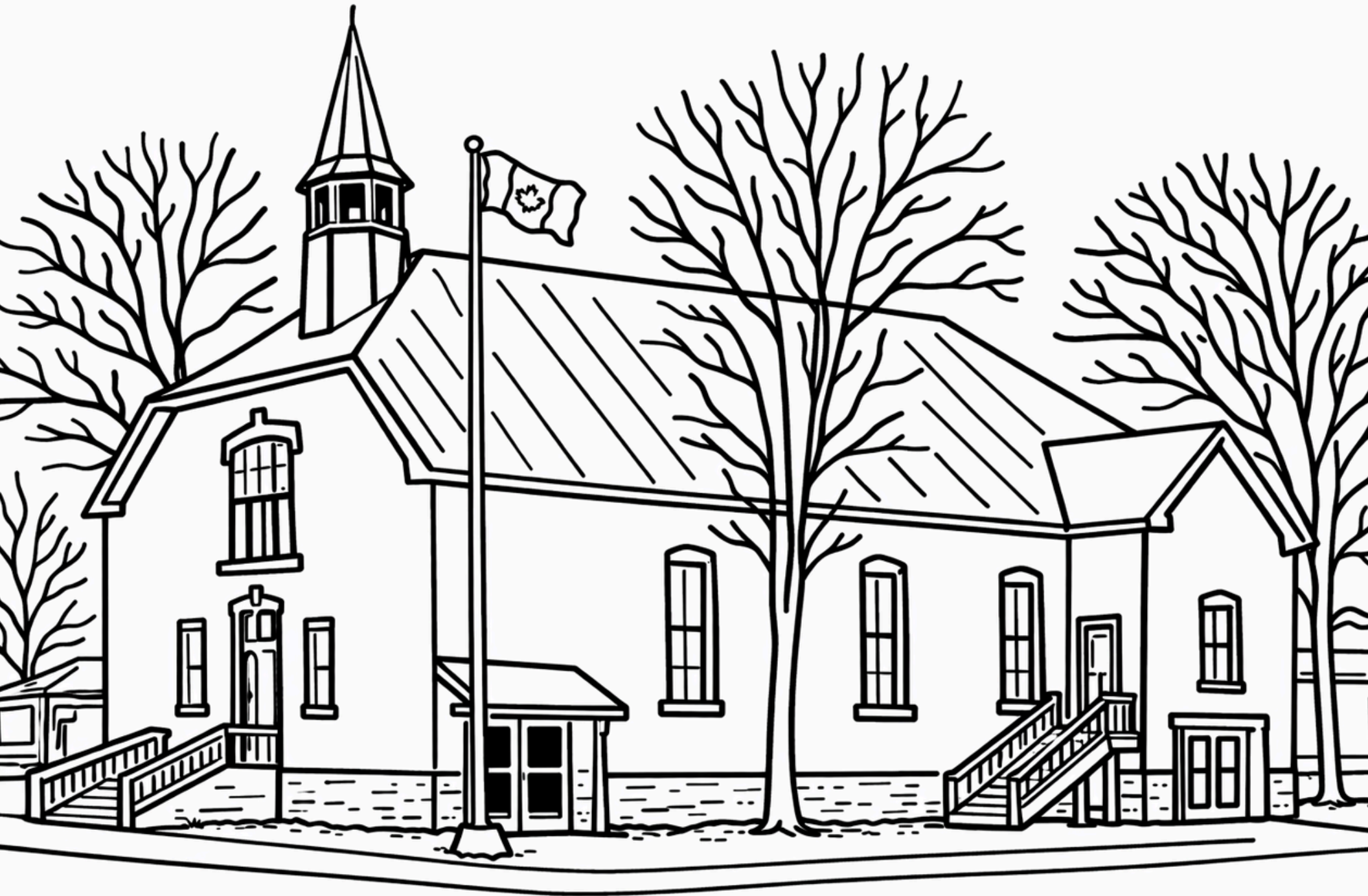
The Woodville Townhall, built 1903